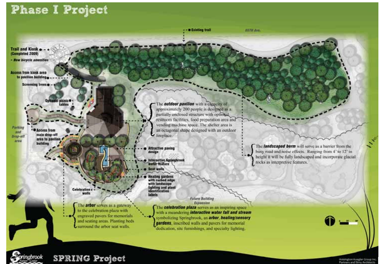
This diagram shows the first phase of the Springbrook SPRING project, the development of an outdoor pavilion and celebration plaza.