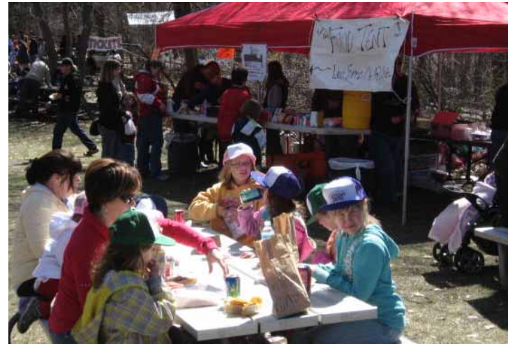
Springbrook’s Spring Fling: The first picnic of the year.

Patrons lingered in conversation, especially enjoying the beautiful weather this year. The board thanks all Food Tent patrons. Next year, plan to attend both Pumpkin Night in