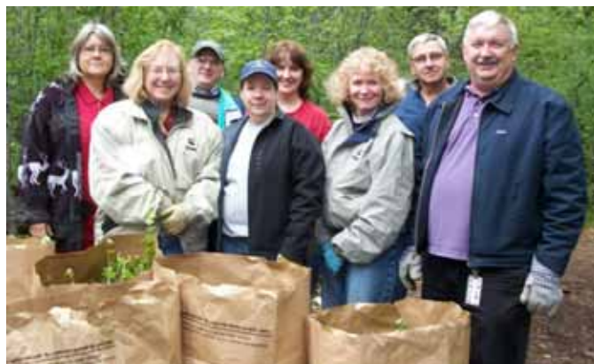
Team members stand alongside bags of removed garlic mustard.

Garlic mustard is a biennial herb that overwhelms na-